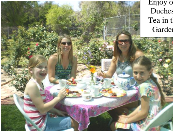
Enjoy our Duchess Tea in the Garden