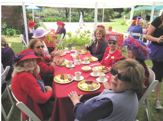
Group seating reservations for 10 or more