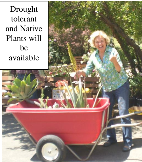
Drought tolerant and Native Plants will be available

Or visit our website at www.chatsworthhistory.com