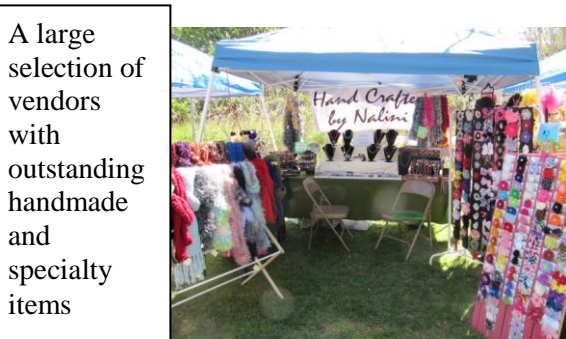
A large selection of vendors with outstanding handmade and specialty items